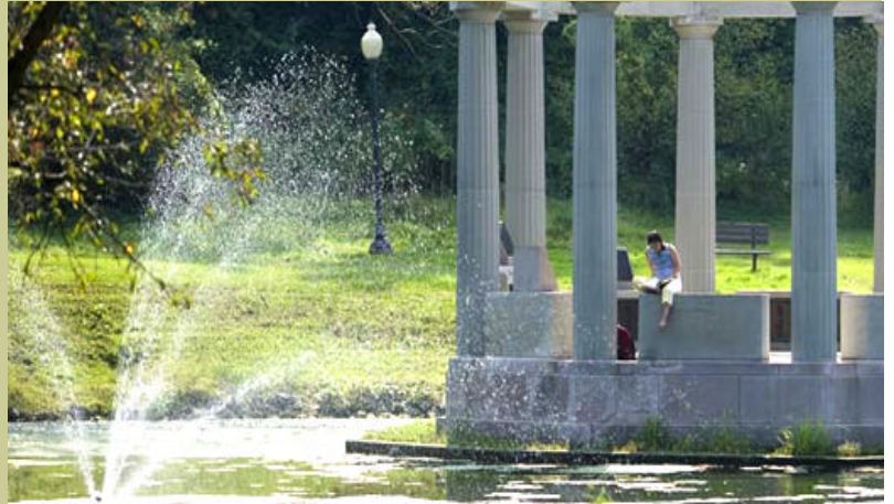
Congress Park, Saratoga Springs